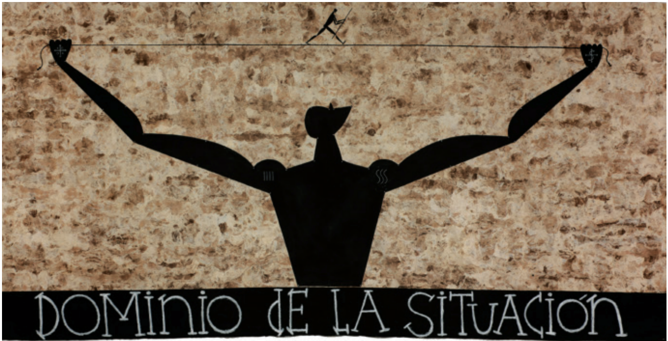
Checklist no. 2

[in the Congo tradition] or Bawande [also spelled Baluandé] . . . or in the Yoruba tradition [she is] Yemayá. 13 Kalunga's power is expressed through her control over the seas; no safe journey across the Florida Straits to a new life in the United States can be accomplished without her blessing. In Mother Ship she appears as emerging from the waters, her head a sturdy rescue ship ready to succor the many drowning balseros whose heads are seen bobbing over the surface of the waters framing the image, offering anchors to those in peril. In one of her many avatars as nurturing mother, here Kalunga literally transforms into the rescue ship, in a depiction that links Bedia's work during this period to that of many Haitian painters, chief among them Edouard Duval-Carrié, who depicted the African-derived deities of Santería and Vodou as accompanying refugees in their perilous crossings to Florida, where they faced both the dangers of the sea and the constant surveillance of a vigilant U.S. Coast Guard. 14