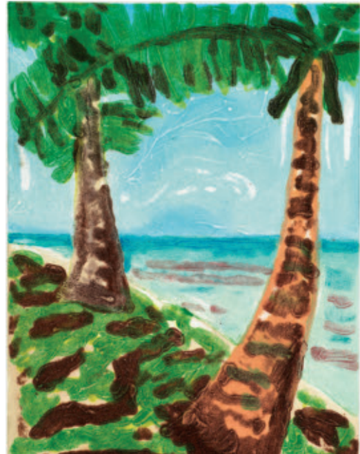
Checklist no. 4

the 1970s, as evidenced by When It Awakens , moved to the political, social, and economic plight of his native Puerto Rico, the wider Caribbean, and Latin America under U.S. domination. What surprises foremost about When It Awakens is the early embrace of a postcolonial environmentalist perspective at a time when Amazonia had become a target for deforestation in order to open the region for logging, cattle grazing, and agriculture under U.S. corporations operating in Latin America. Capturing a moment of crucial environmental decision for the region, Ferrer's use of the surveillance map forces a look from above, a blend of surveillance and mastery that lays bare his condemnation of both the U.S. neocolonial presence and the powerlessness of those without access to the technologies of dominance. It is an environmental depiction that contrasts sharply with the serene natural scene of Vassar's Untitled (1984), an example of the artist's "tropical sublime" project. Untitled was Ferrer's contribution to The Atelier Project , a collection of sixteen prints by distinguished American artists commissioned by the Division of Visual Arts of the State University of New York at Purchase and meant primarily as a teaching tool.