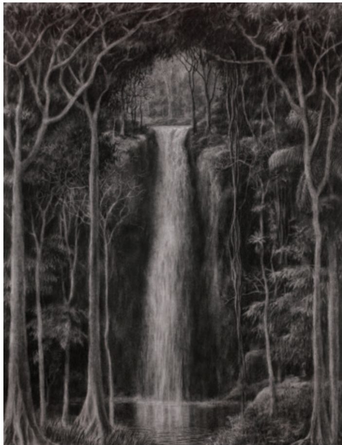
Checklist no. 9

Ponce Inter-Continental Hotel, Ponce, Puerto Rico , a screenprint with acrylic and watercolors by Enoc Perez (Puerto Rico, b. 1967)—a haunting depiction of an abandoned hotel as an architectural revenant—may at first glance appear to epitomize the exact inverse of Sánchez’s primeval