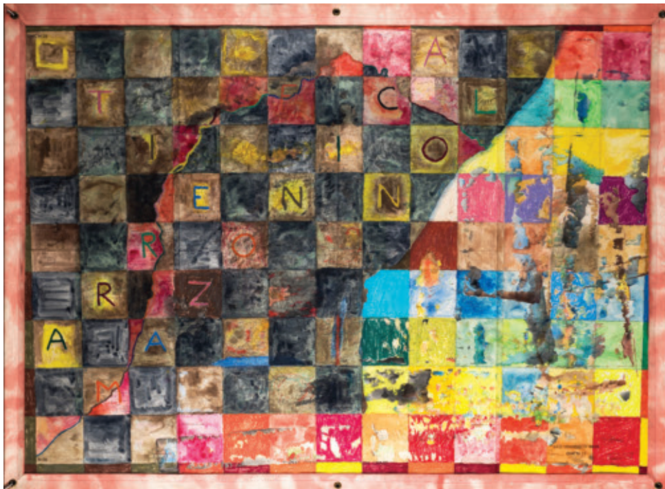
Checklist no. 3

Ferrer (Puerto Rico, b. 1933) was trained in Paris, where he worked under the guidance of Spanish Surrealist Eugenio Granell and met Wifredo Lam. An early solo show at the Whitney Museum of American Art in New York in 1971 brought him to prominence in the United States art world precisely at a time when he began consciously to work on shedding the “cool” American conceptualist label he had attained in the late 1960s to embrace an engagé aesthetic and proclaim his dissatisfaction with the state of art as a product made by and for an elite. True to Lam's mentorship, his work in